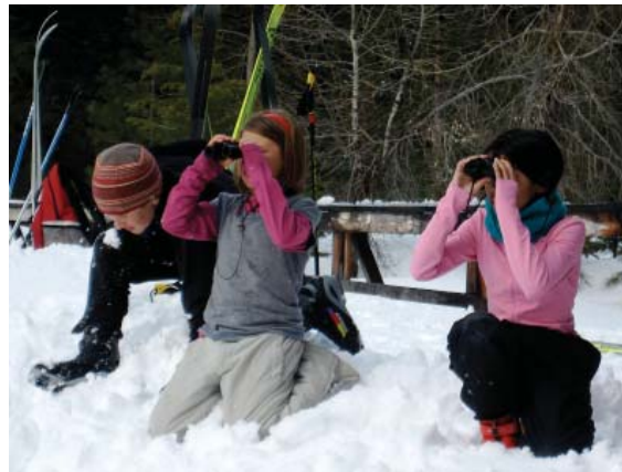
Students at the Methow Valley Community School combine birding with their other outdoor activities.