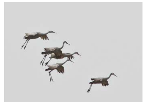
Sandhill Cranes with landing gear extended.

This is the time of year when celebrations for birds abound! The Audubon Washington website lists four in April and six in May and I can see that they have missed a few. Birding festivals are great learning opportunities - chances to see interesting, maybe charismatic birds in their native habitats on field trips led by local experts. They are also a chance to meet like-minded people who enjoy birds and birding.