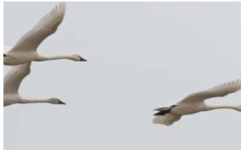
Tundra Swans flying over Okanogan County